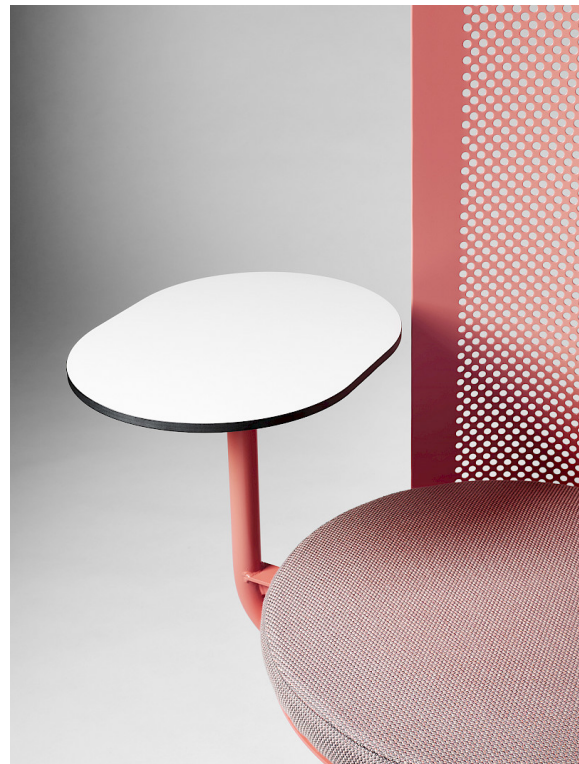
The desktop is made of light grey high-pressure laminate with a black core.

The cushion is stuffed with 'Dry Foam' and upholstered in fabric made of dyed acrylic from Sunbrella. The cushion dries instantly and is suitable for outdoor use. The fabric is also UV-resistant and easy to keep clean.