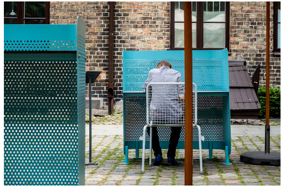
Work Desk during the exhibition at Form/Design Center in Malmö.