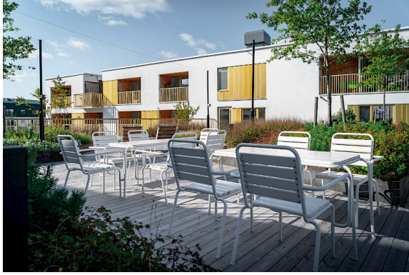
The Tuben furniture group, designed by Gunilla Hedlund. The lightweight structure of these stackable designs gives them a breezy appearance that resonates with modern buildings and the open-air environments surrounding them.