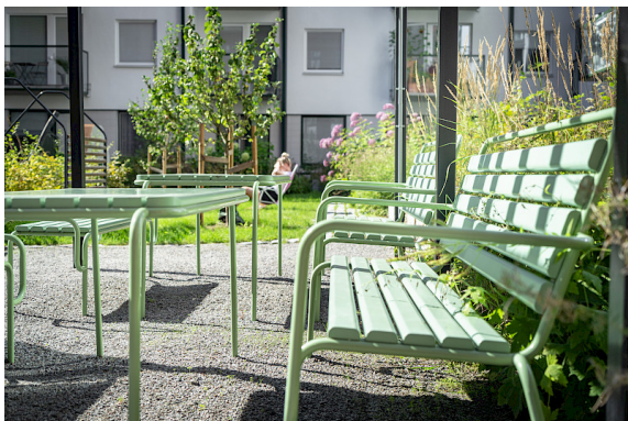
The Tuben furniture group, designed by Gunilla Hedlund. The lightweight structure of these stackable designs gives them a breezy appearance that resonates with modern buildings and the open-air