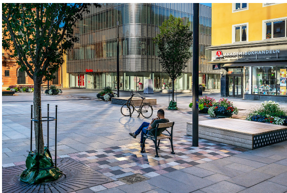
Tessin fütölj stora torget Uppsala