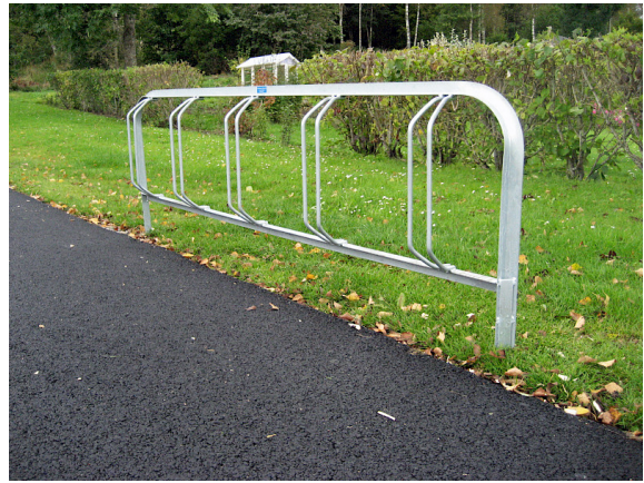
Ö03-13R, markfast cykelställ med rak inbörning