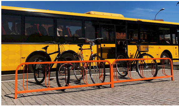
Ö03-13R special pulverlackerad