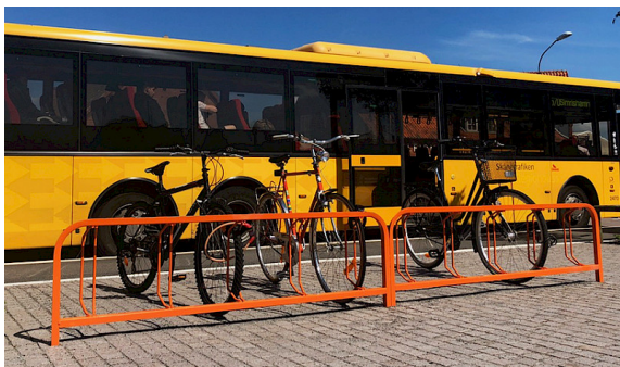
Ö03-13R special pulverlackerad