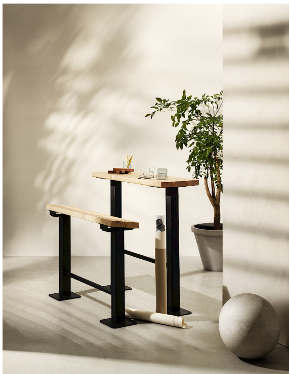
Tillsammans skapar Schoolyard bänk och bord en arbetsstation för utomhusklassrum.