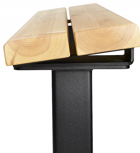
Lutningen på sitsen ger en mer behaglig sittställning.