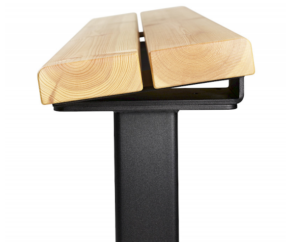
Lutningen på sitsen ger en mer behaglig sittställning.