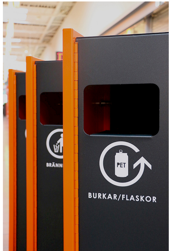
The picture shows examples of decals.