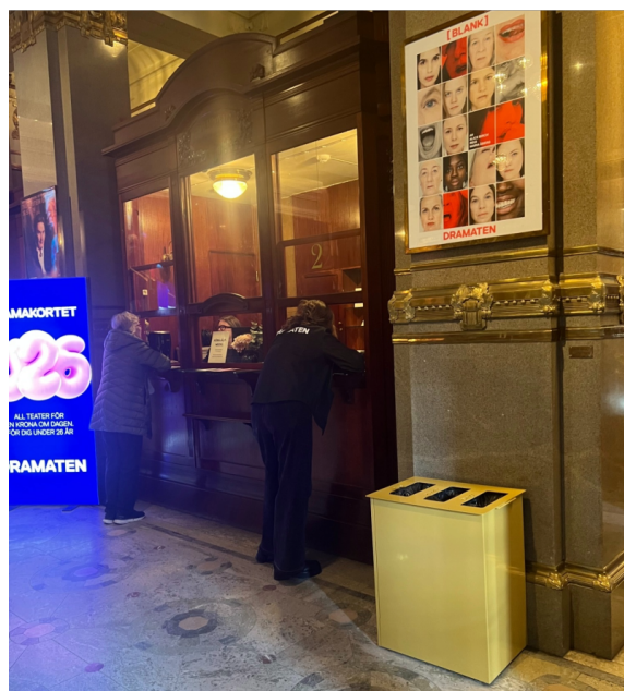
Rekta Papperskorg på Dramaten i Stockholm.