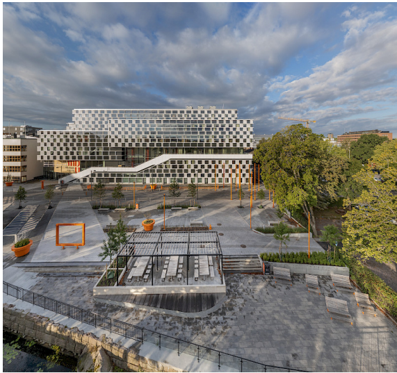
Bilden visar bland annat Terrass pergola, Parco möbelgrupp och Kajen solsoffa på gården av Mälardalens Universitet.