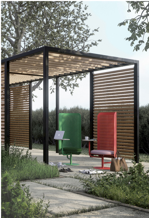
The system includes a number of alternatives that enable the pergola to change character, including an option for walls of laser-cut sheet steel or trellis sections in oak.