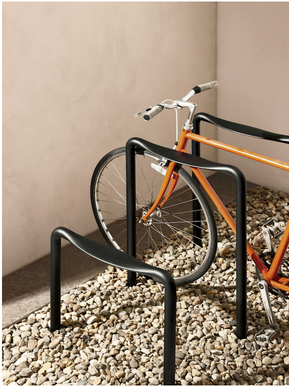
Paus works both as a bike rack and a seat support.