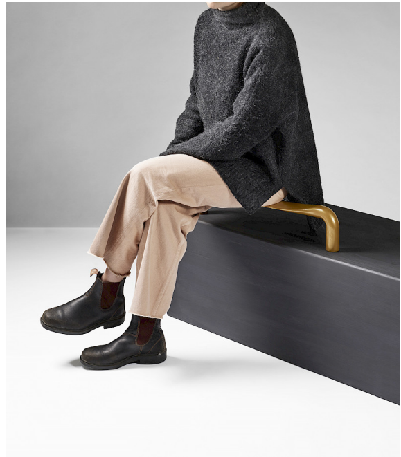
Pause adapted for mounting on a wall. The soft and flat upper makes a great surface to sit on.