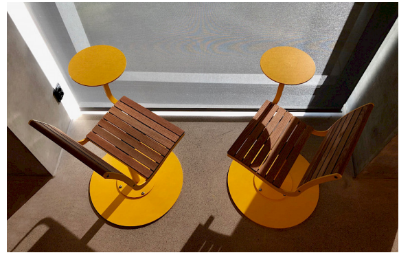
Workplaces from Humanisten, University of Gothenburg. Powder coated in RAL1018. Seat and backrest in oak. Mounted on a plate for free-standing furnishings.