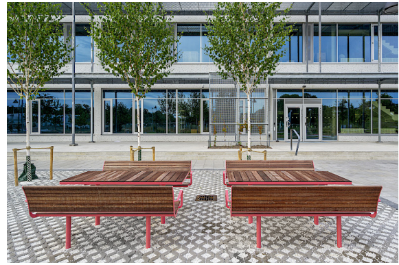
Parco park bench and table at Fornudden's schoolyard in Tyresö.