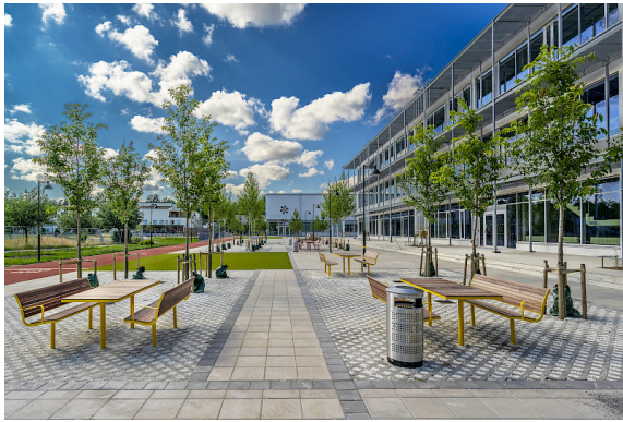
Parco consists of sleek products that are easy to cluster together, making them ideal for communal seating. The products can be mixed and matched to create customised seating arrangements in a variety of indoor and outdoor settings.