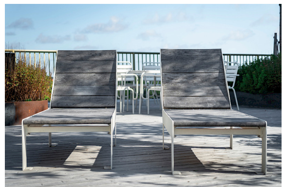
In Rosendal, Uppsala, LowBed glides the area's roof terraces.