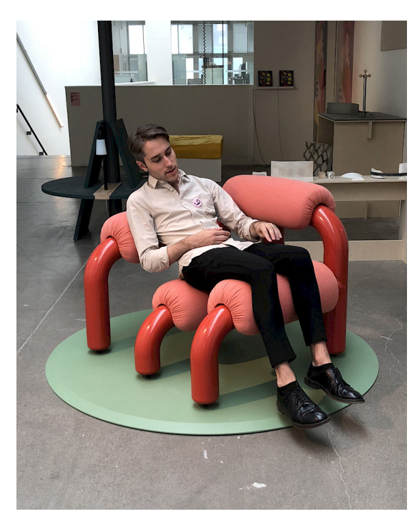
Konstfacks vårutställning 2018