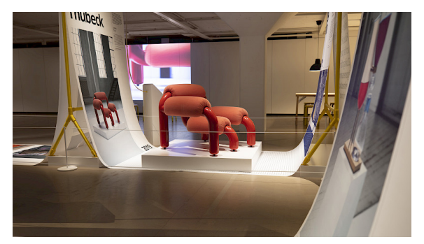
© Inter IKEA Systems B.V. 2020