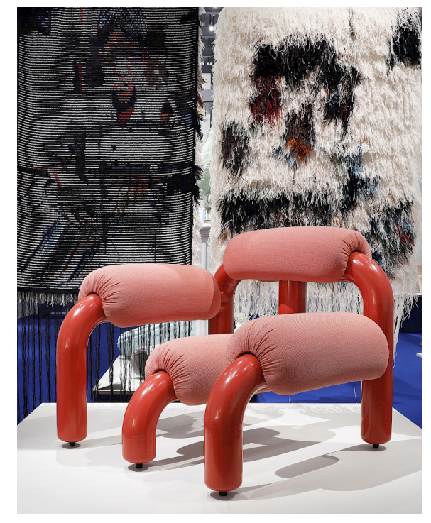
Ung Svensk Form 2019, ArkDes, Foto Jeanette Ha gglund.