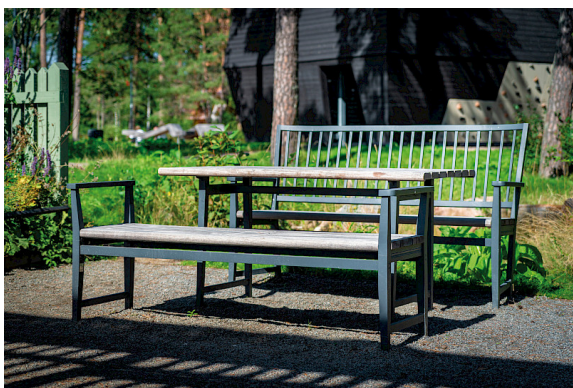
Leksand backed bench, table and bench in Rosendals park, developed in collaboration with Temagruppen.