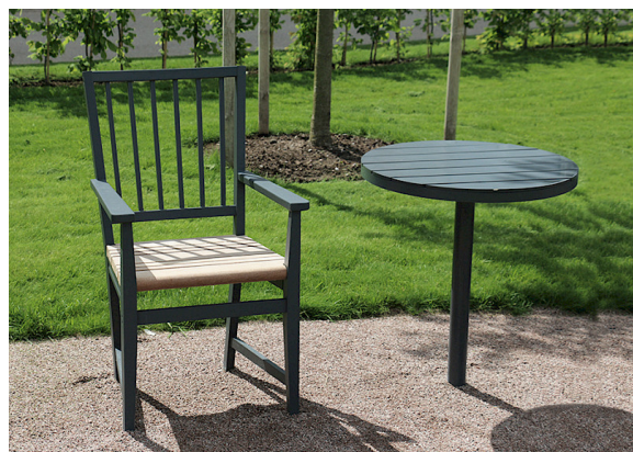
Leksand-fåtölj bredvid ett runt Parco-bord.

Med en lite högre sitthöjd (49 cm) är stolen tillgänglighetsanpassad. Armstöden är förlängda och greppvänliga.