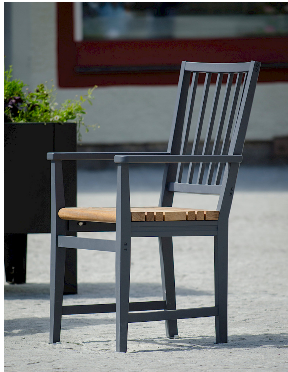
Leksand-fåtölj, framtagen i samarbete med Temagruppen. Foton från Z-torget i Leksand kommun.

Inspirationen har hämtats från den klassiska trästolen som tillverkades i Leksand under tidigt 1800-tal.