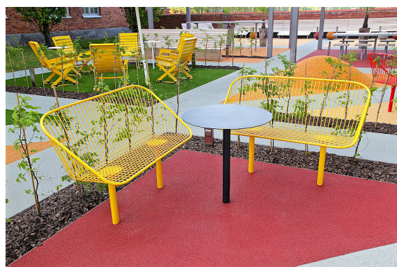
Från Castellums utomhuskontor WorkOut i Växjö.