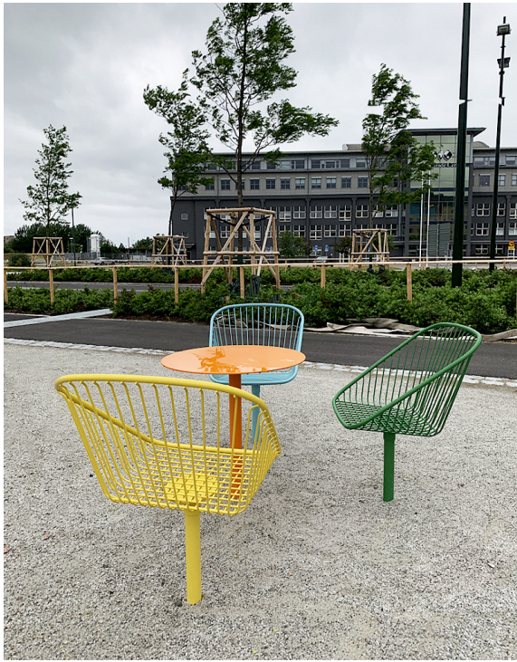
Oliva kulörer blandat i Västra Hamnen i Malmö.