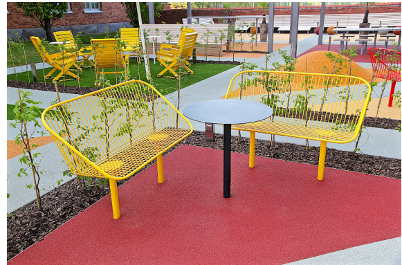
Från Castellums utomhuskontor WorkOut i Växjö.