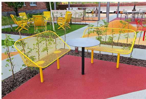
Från Castellums utomhuskontor WorkOut i Växyö.