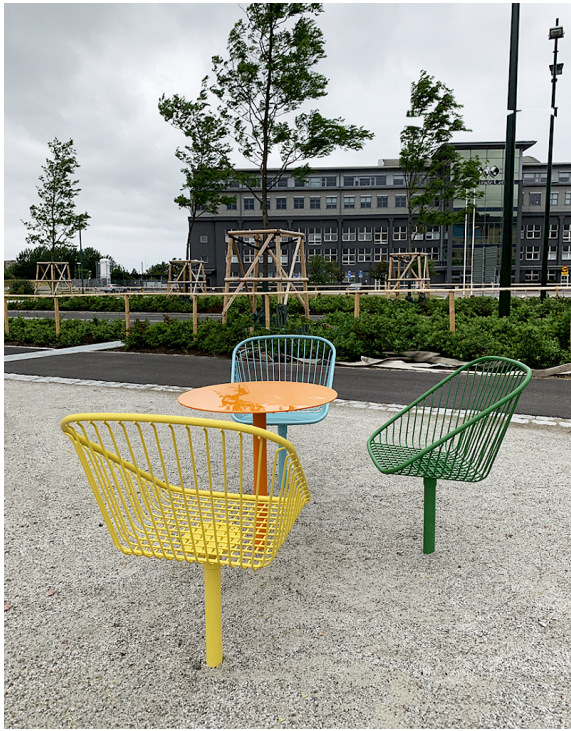
Otiba kulörer blandat i Västra Hamnen i Malmö.