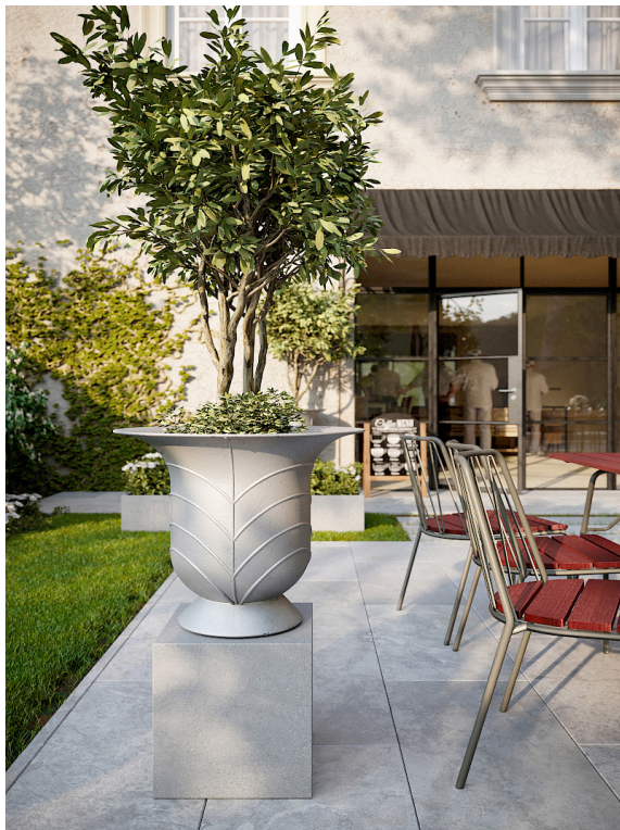
Klocka planteringsurna i återvunnen aluminium och stolar Rosseau med sits i FSC märkt mahogny.