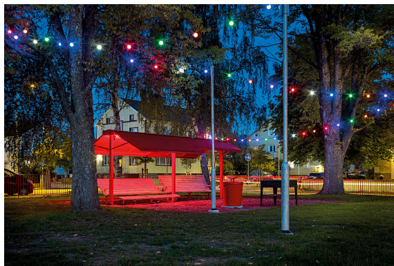
Badhusparken i Vara.