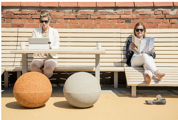
Kajen Solsoffa är ett härligt tillägg till ute kontoret Workout i Växjö.