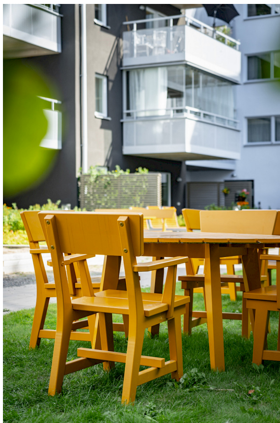
The Hjorthagen furniture group, designed by Peter Brandt, is the perfect combination of traditional garden furniture and contemporary outdoor design.