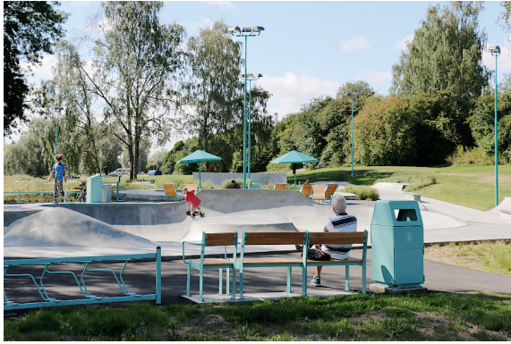
Thanks to High Chair and High Sofa, you can sit comfortably as a spectator in Västerås skatepark.