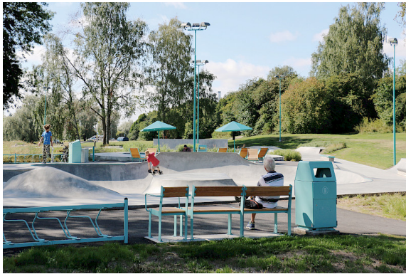
Thanks to High Chair and High Sofa, you can sit comfortably as a spectator in Västerås skatepark.