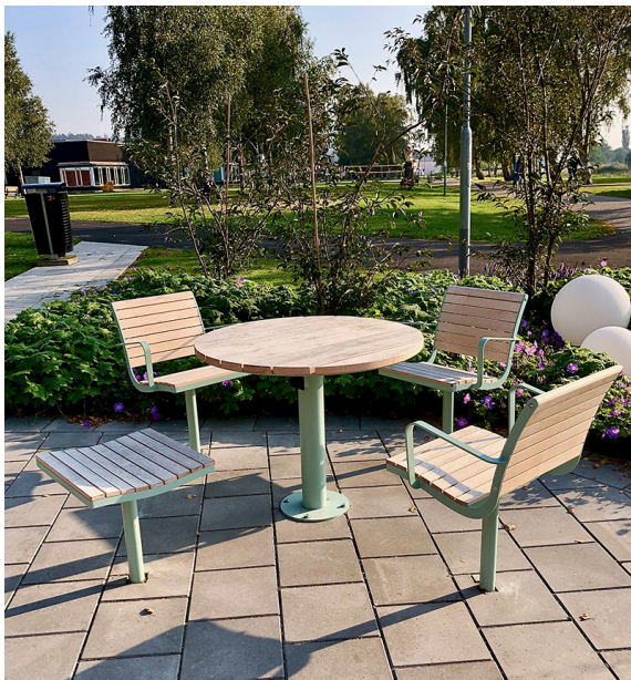
High Table together with armchairs and stools from our Parco furniture series.