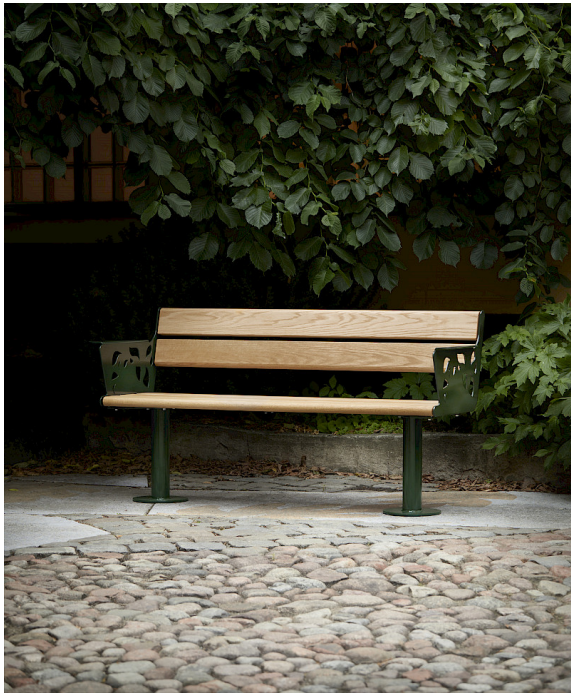
Incorporating a pattern or symbol into the armrests gives the bench a uniquely individual expression.