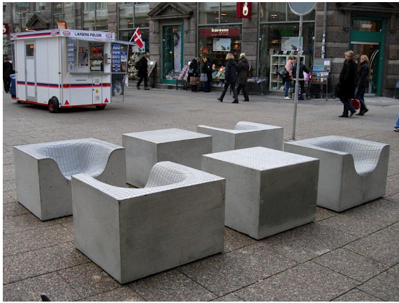
Concrete Things Armchair and table in concrete.