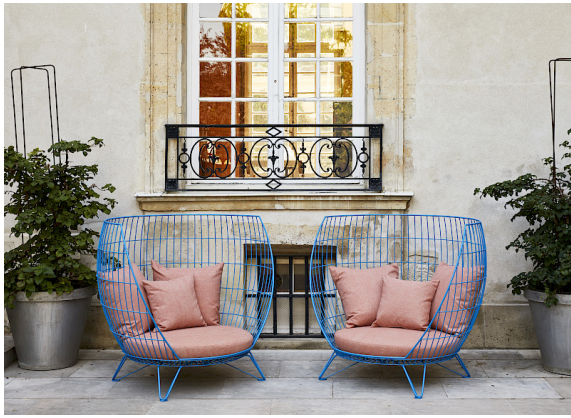
The generous and comfortable Big Basket by Ola Gillgren at the Swedish Institute's courtyard in Paris.