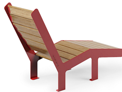
The High Sunchair was released in 2022.