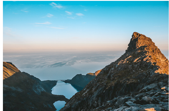
Kebne outdoor gym is inspired by the mountain peaks of Kebnekaise and contributes with the aesthetic value of a sculpture in an open landscape.