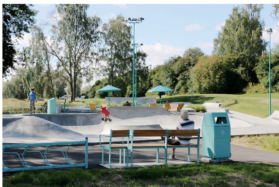
Thanks to High Chair and High Sofa, you can sit comfortably as a spectator in Västerås skatepark.