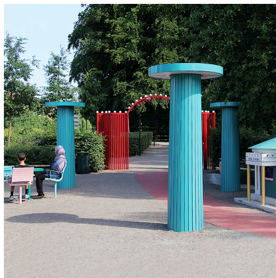
Teaterlekplatsen in Malmö